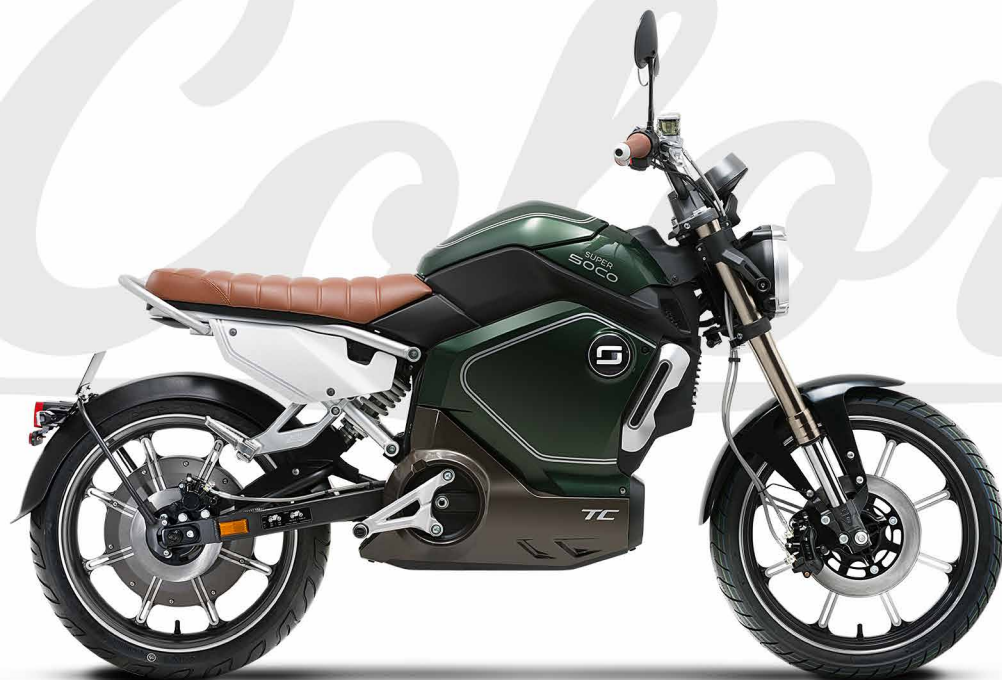
• VINTAGE GREEN

Exclusive classic Café Racer. Be an elegant biker.