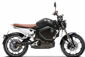
• DIAMOND BLACK