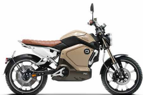
• KHAKI YELLOW