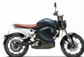
• DARK SEA BLUE